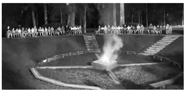
Above: "The Bowl" at Camp Suwannee is home to many fond memories for both past and present campers.